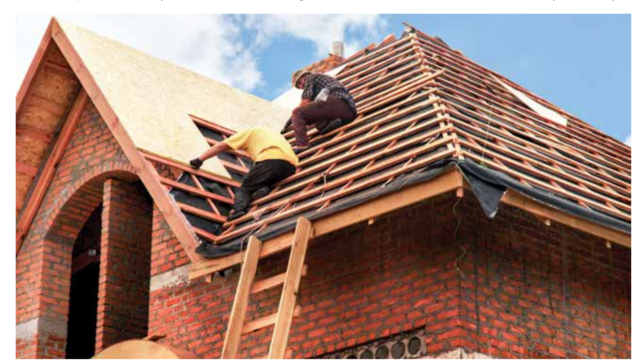
▲ Fixing a roof requires expertise and should be maintenance-free.

Tata BlueScope Steel is working towards creating sustainable and innovative building materials and products that will help reduce adverse impact on the environment. The thermal conductivity of the products is 0.167 W/mk against colour coated metal sheets 46w/mk hence the thermal insulation performance is expected to be superior than colour coated sheets. "Since the sheet weight is relatively low, the freight cost per sheet is also low. Lower sheet weight also helps in bringing down the overall structure cost compared to other alternatives. Thus it proves to be very beneficial on all accounts. The innovated products is light weight and high strength and meets performance requirement of national and international standards like IS 14871, EN 494 and ISO 9933," says Choudhary.