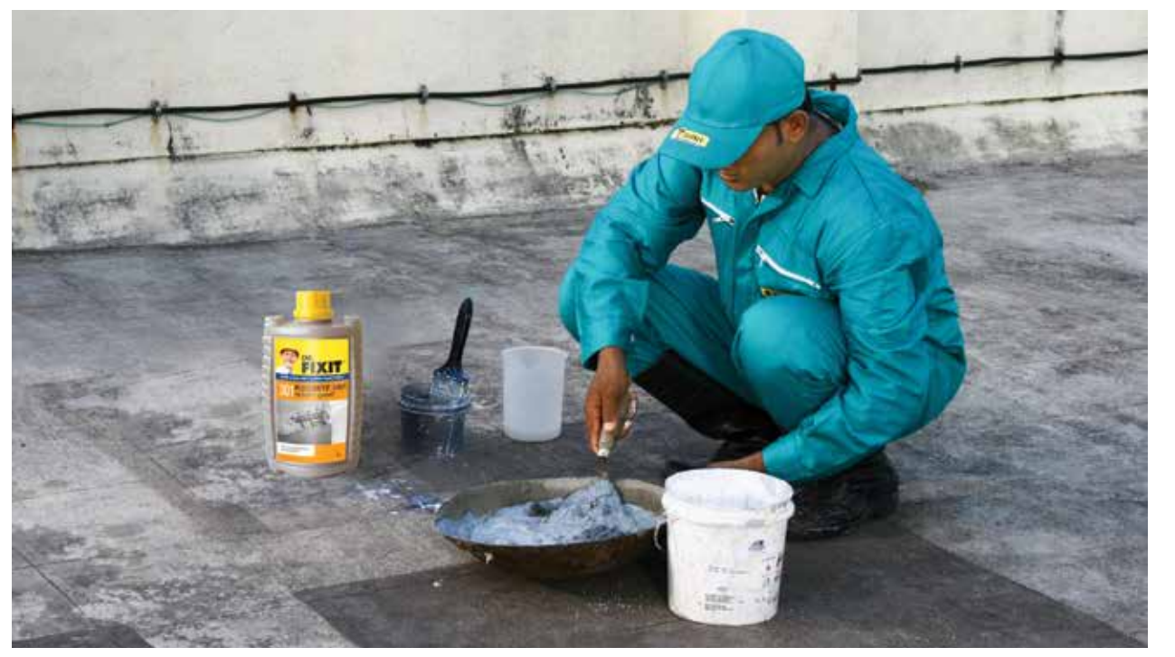
▲ R&D of chemicals plays an important role in acquiring the right waterproofing.

66 CONSTRUCTION WEEK JUNE 2018 CONSTRUCTION WEEK JUNE 2018