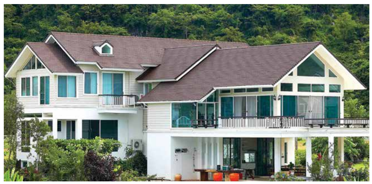
▲ Roofing tiles come in myriad shapes and materials and users would best be adviced by architects.