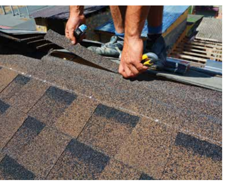
▲ The right sealant plays an important role in leak-proofing roofs.